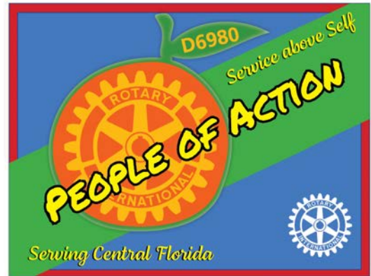
THE ROTARY MOTTO FOR CENTRAL FLORIDA